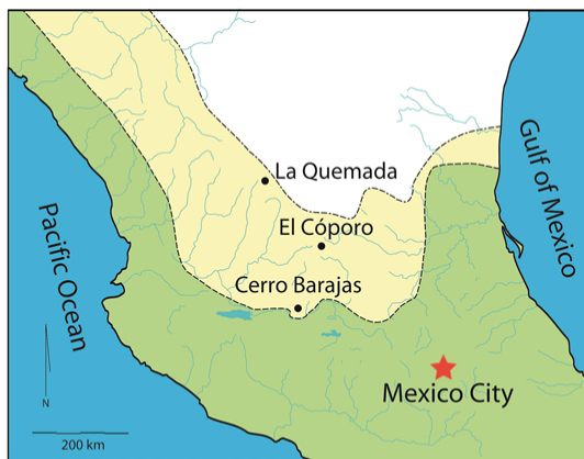
■ Extent of Mesoamerica between AD 200 - 900 ■ Extent of Mesoamerica at AD 1519 ● archaeological site